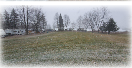
Frozen lake Niapenco at the edge of the Germania Park Campground